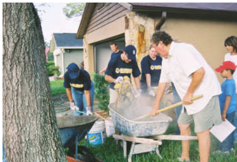
Volunteers mixing concrete for a wheelchair ramp

CIL's Rampage! 2006 wheelchair-ramp building event is Saturday November 4. The second annual Rampage brings together CIL staff and volunteers for an all-day, Central Florida-wide, ramp building event aimed at giving people with disabilities more independence and freedom.