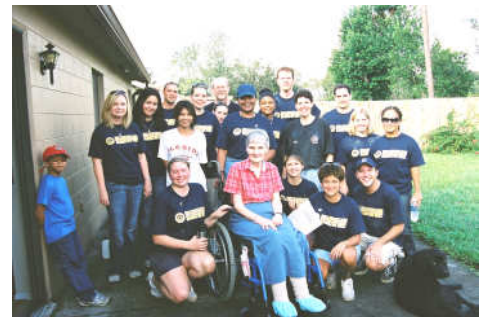
A Job Well Done!

Only 0.9% of U.S. homes currently have a wheelchair ramp, yet 29.2% of families include at least one member with a disability. One or two steps separate many people in Central Florida from working, going to the store, or visiting family and friends.